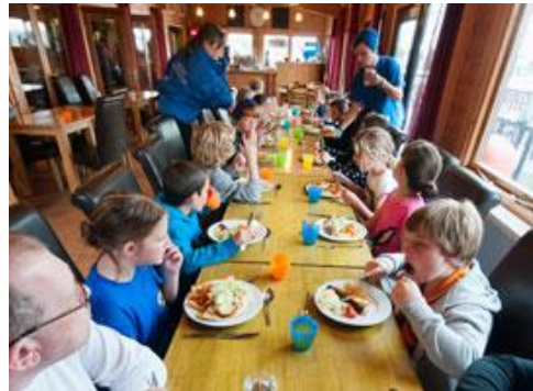
Bar & eatery