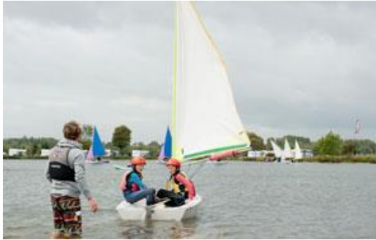
12 acre lake